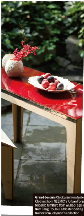
Grand designs Clockwise from far left: Clothing from NEEMIC's 'Urban Forest'; foldable furniture from Wuhaio; a pillow from Tang Roulou; a hipster-baiting trainer from Jellymon's collection

mix of clothing and electronic music will be on offer, alongside a new line of limited-edition METROBAGS and NLGX's autumn Graphic Tee collection.